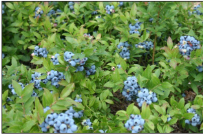
Blueberry | Vaccinium angustifolium up to 200 sq ft per pallet | Min. order 200 sq ft*

Minimum orders apply. We may be able to reduce the minimum if multiple varieties are being ordered for delivery at the same time. Delivery is additional, not included in prices below. Please contact us for a quote on any high volume orders. Prepayment is required and native sod orders may not be cancelled, changed, or refunded once harvesting has begun.