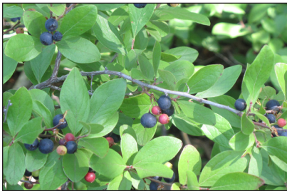
Huckleberry | Gaylussacia baccata up to 200 sq ft per pallet | Min. order 200 sq ft*