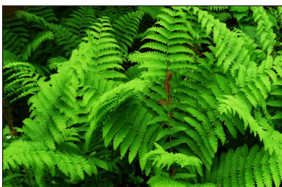
Interrupted Fern | Osmunda claytoniana up to 150 clumps per pallet | Min. order 150 clumps*